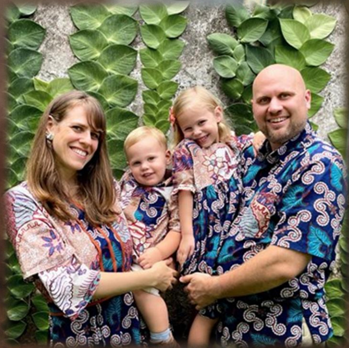
The Hoobyar's – Asia Pacific

We've been able to expand our global reach by supporting these families serving in Muslim-majority areas: